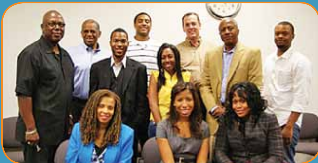
Tutors and mentors from the POH Riley Scholars Program

The University of Michigan’s Center for Educational Outreach has accepted a proposal from the Pontiac School District to present a session on the POH Riley Scholars in-school tutoring program at the 2011 Michigan Pre-College and Youth Outreach Conference, A Call to Action: Building A College Going Culture , November 14, 2011, in Ann Arbor. The session, Impact of In-School Tutorial Assistance on Academic Achievement/ Social Responsiveness in an Urban High School , will present the results of the POH Riley Foundation’s in-class tutoring program at Pontiac High School’s Ninth Grade Academy this past year.