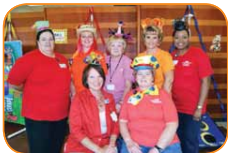
PEAC Committee Members