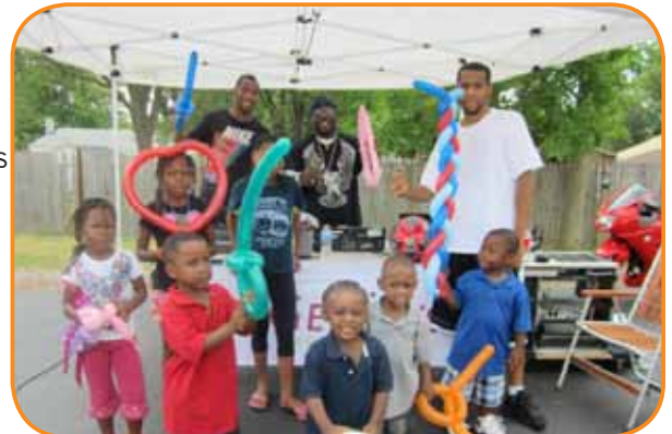
QTMC (Quest To Make A Change) provides entertainment for youth at the Children's Sports Health Fair.

Aimed at keeping kids active and healthy, POH Regional Medical Center and the POH Riley Foundation hosted the event just in time for the upcoming fall sports season.