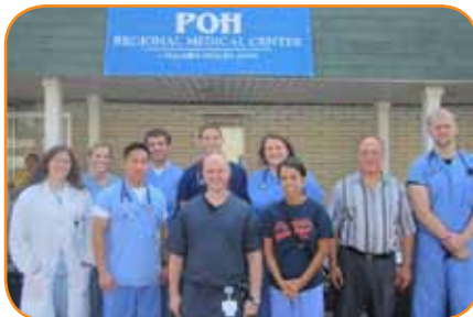
POH Regional Medical Center physicians and residents volunteer to provide physicals for the Children's Sports Health Fair.